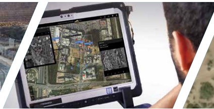
BLOS monitoring of key points for intelligence, surveillance, and reconnaissance (ISR)