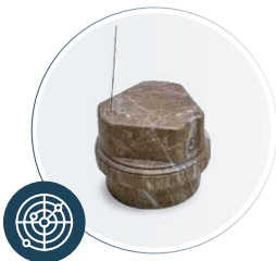
Doppler Radar Sensor