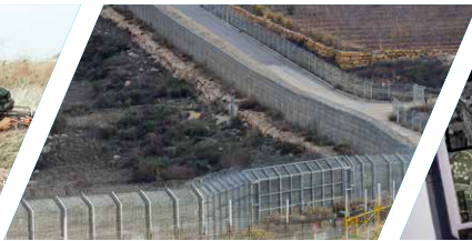
Border and site protection