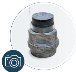
Radar Day/Night Camera