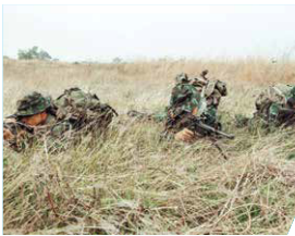
Force protection and ambush